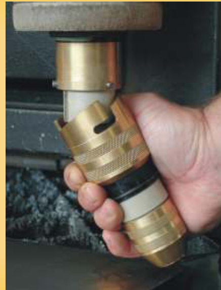
Quick-change torch PerCut 90