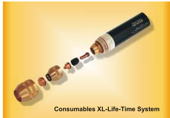
Consumables XL-Life-Time System

The high performance capacity of the plasma torch PerCut 80 ensures in connection with the heavy duty XL-Life-Time system and its longevity of cathodes and nozzles (up to 1,200 piercings with edge squareness still below 3°) lowest costs on consumables and minimized downtimes . The technical conditions for the high productivity of the plasma cutting process are optimized operational parts of the beam generation system interacting with microprocessor controlled sequences.