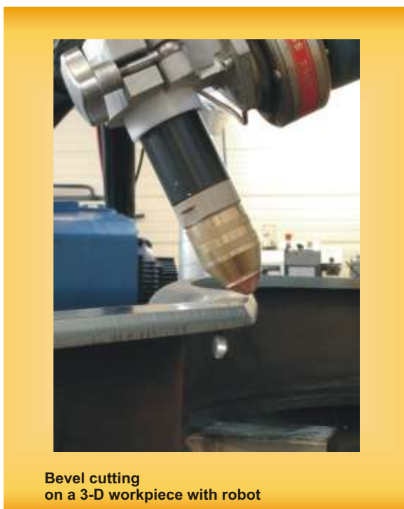
Bevel cutting on a 3-D workpiece with robot

For the moment this unique plasma cutting unit with HiFocus PLUS technology will be offered in this performance class for the plasma gases oxygen and air. Because of the outstanding price-performance ratio especially the medium sized industry now is in the position to compete on the market with high-class cutting work.